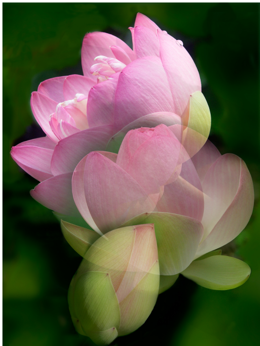
Color Print by Barb Staggs