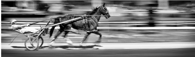
Monochrome Digital